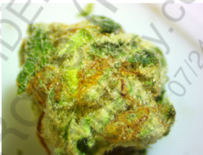
Image 2 - Identity A - Macroscopic Identification