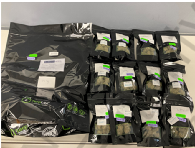
Image 1 - Sample in packaging as received from client